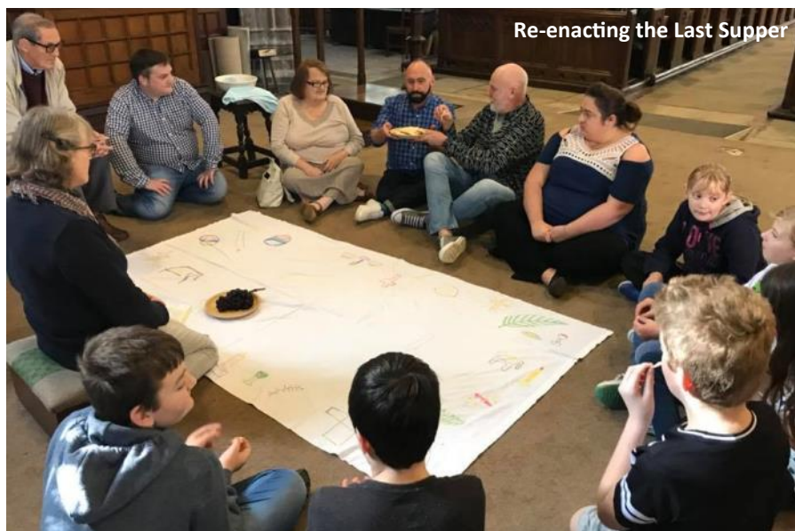
Re-enacting the Last Supper