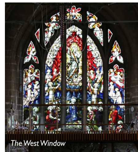
The West Window