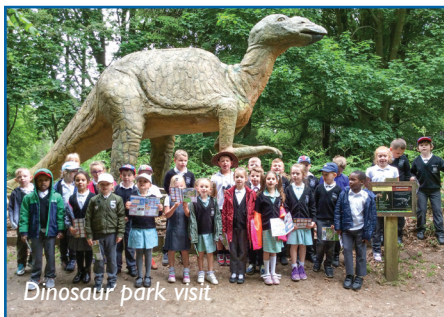
Dinosaur park visit

This is always a particularly busy term and we are currently enjoying curriculum excursions out of school ranging from the Dinosaur park and Yorkshire sculpture park to Lincolnshire show where we once again hope to achieve extremely well as our pupils have put in so much work around water.