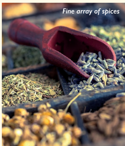
Fine array of spices