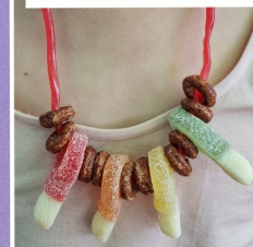
Edible Crown Jewels